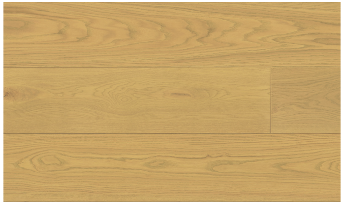
Sand 100005135 - 9 1/2"x87" 4mm Engineered Hardwood