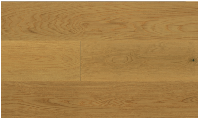
Dune 100005139 - 9 1/2"x87" 4mm Engineered Hardwood