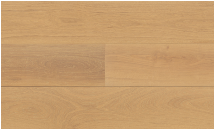
Beach 100005137 - 9 1/2"x87" 4mm Engineered Hardwood