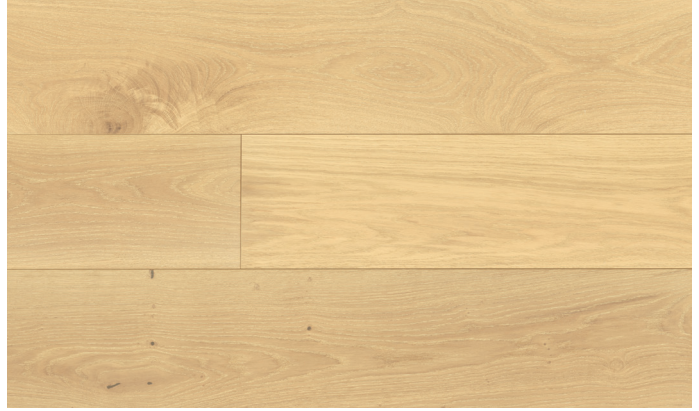
Naturale 100006757 - 9 1/2"x87" 4mm Engineered Hardwood