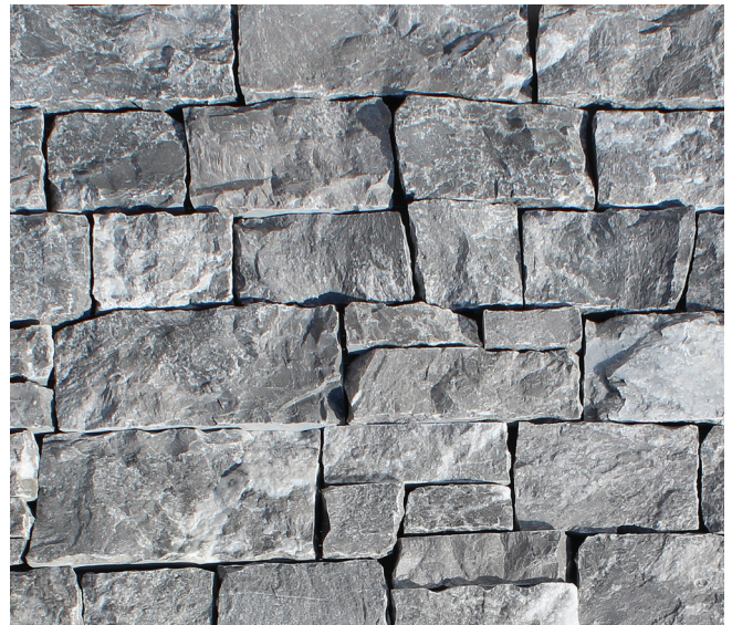
Fossil Grey 100006772 - 8"x24" Marble Ledger - Honed