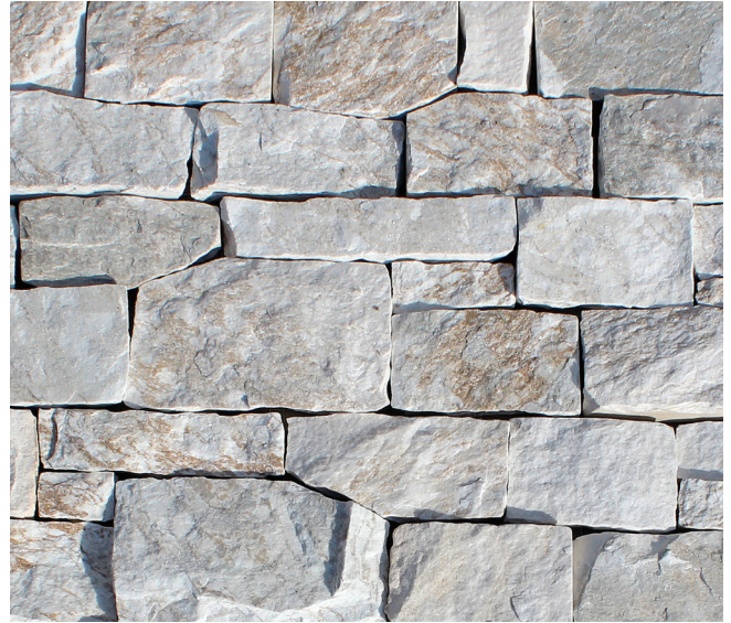
Malibu White 100006766 - 8"x24" Marble Ledger - Honed