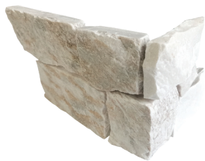
Malibu White 100006767 8"x24" Marble Ledger Corner - Honed