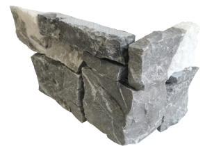
Fossil Grey 100006773 8"x24" Marble Ledger Corner - Honed