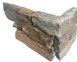
Amber Gold 100006771 8"x24" Marble Ledger Corner - Honed