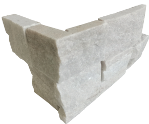
Glacier White 100006769 8"x24" Marble Ledger Corner - Honed