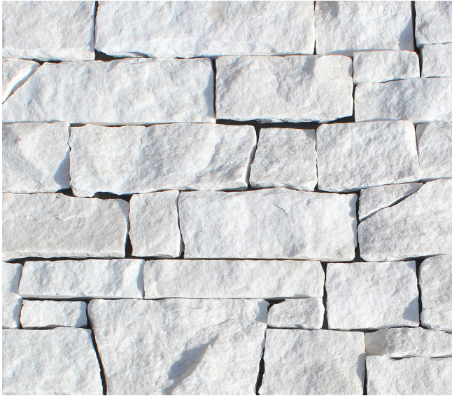
Glacier White 100006768 - 8"x24" Marble Ledger - Honed