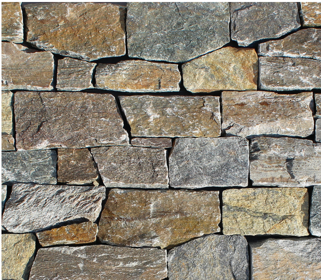
Amber Gold 100006770 - 8"x24" Slate Ledger - Honed