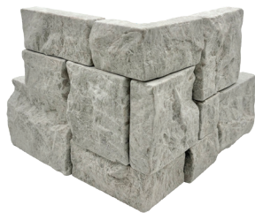
Taupe 100006899 8"x24" Limestone Ledger Corner - Tumbled