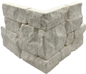
Light Beige 100006897 8"x24" Limestone Ledger Corner - Tumbled