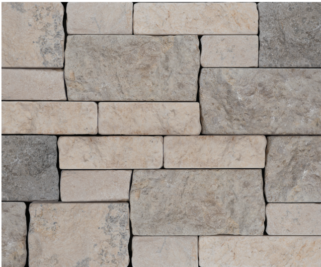
Mixed Beige and Grey 100006900 - 8"x24" Limestone Ledger - Tumbled