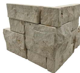
Mixed Beige and Grey 100006901 8"x24" Limestone Ledger Corner - Tumbled