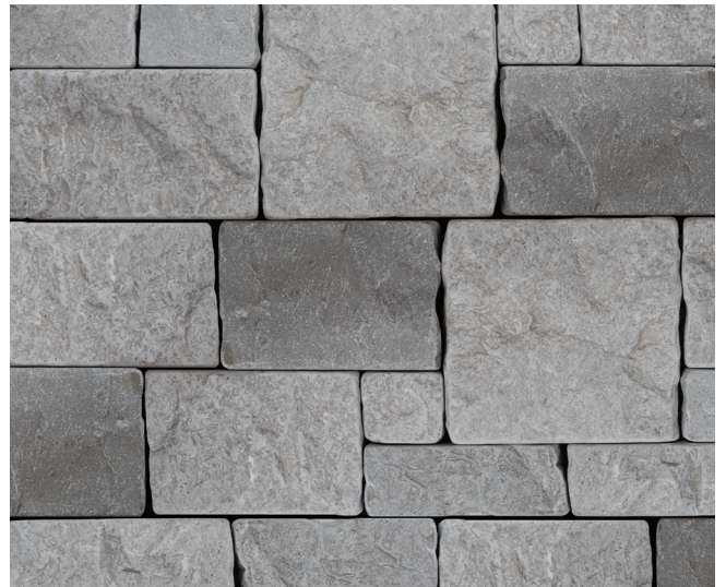
Grey 100006894 - 8"x24" Marble Ledger - Tumbled