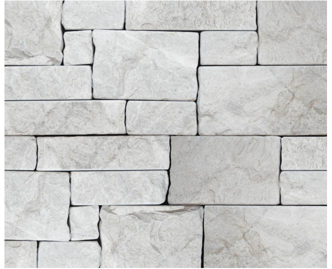
Taupe 100006898 - 8"x24" Marble Ledger - Tumbled