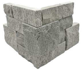
Grey 100006895 8"x24" Marble Ledger Corner - Tumbled