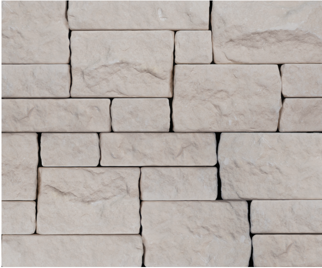
Light Beige 100006896 - 8"x24" Limestone Ledger - Tumbled