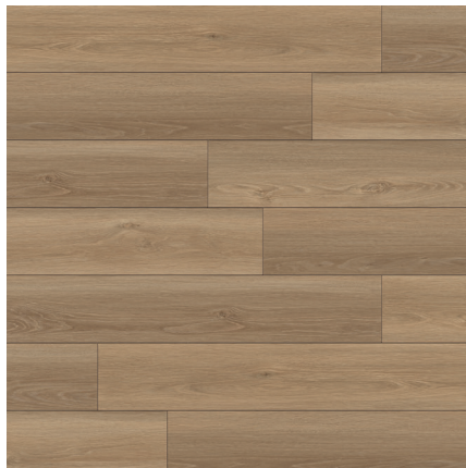
Cliffridge 100007630 9"x60" 12mm Engineered HDF Wood