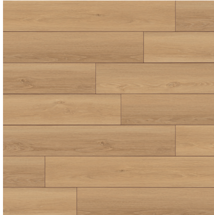
Bahia 100007633 9"x60" 12mm Engineered HDF Wood