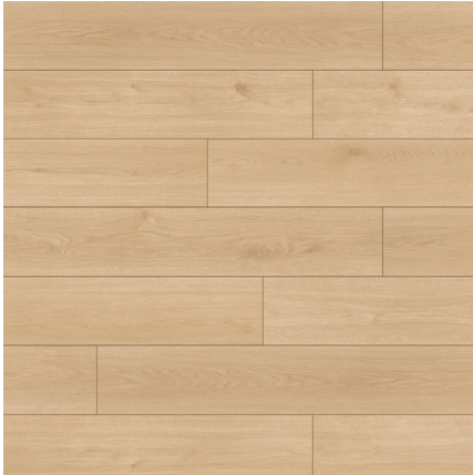
Soledad 100007632 9"x60" 12mm Engineered HDF Wood