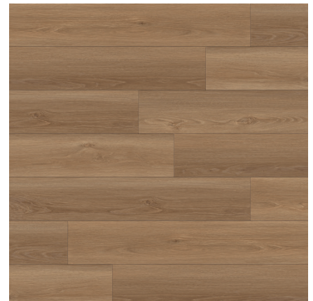
Miramar 100007629 9"x60" 12mm Engineered HDF Wood