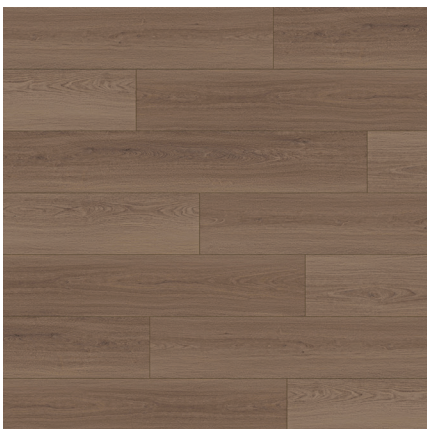
Nautilus 100007628 9"x60" 12mm Engineered HDF Wood