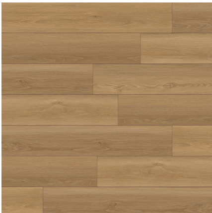
Prospect 100007631 9"x60" 12mm Engineered HDF Wood