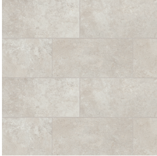
Sale - SAL ASCSTOSAL1224 12"x24" Rectified Field Tile - Matte