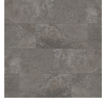
Terra - TER ASCSTOTER1224 12"x24" Rectified Field Tile - Matte