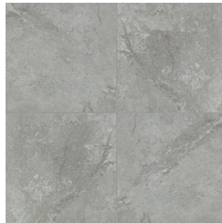
Cenere - CEN ASCSTOCEN3636 36"x36" Rectified Field Tile - Matte