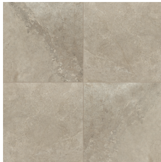
Sabbia - SAB ASCSTOSAB3636 36"x36" Rectified Field Tile - Matte