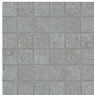
Cenere - CEN ASCSTOCEN22MO