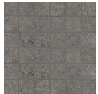
Terra - TER ASCSTOTER22MO