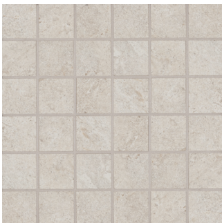
Sale - SAL ASCSTOSAL22MO