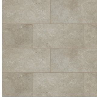
Sabbia - SAB ASCSTOSAB1224 12"x24" Rectified Field Tile - Matte