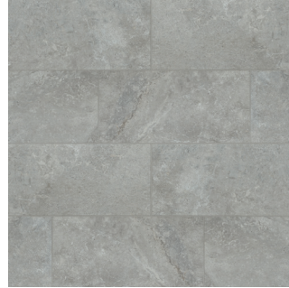
Cenere - CEN ASCSTOCEN1224 12"x24" Rectified Field Tile - Matte