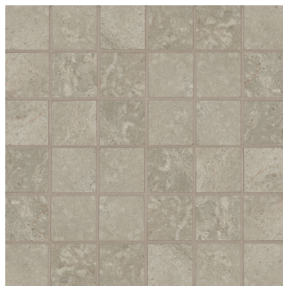
Sabbia - SAB ASCSTOSAB22MO