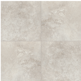
Sale - SAL ASCSTOSAL3636 36"x36" Rectified Field Tile - Matte