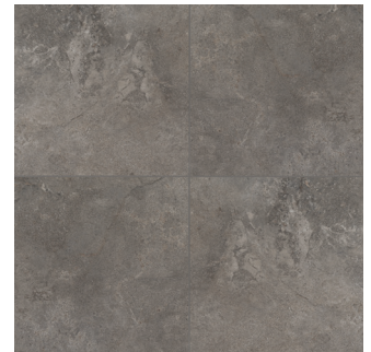
Terra - TER ASCSTOTER3636 36"x36" Rectified Field Tile - Matte