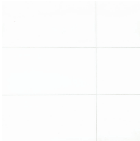
White - W ATLSHAPLAWHI1632M - 16"x32" Plain/Flat Design Matte