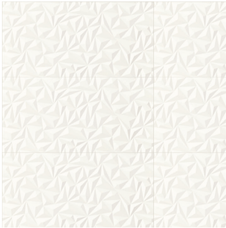
White - W ATLSHAANGWHI1632M - 16"x32" Angle Design Matte