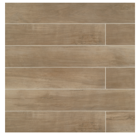
Clay - CLA CRDANTCLA848-N - 8"x48" Rectified Field Tile - Matte