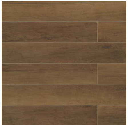
Walnut - WAL CRDANTWAL848-N - 8"x48" Rectified Field Tile - Matte