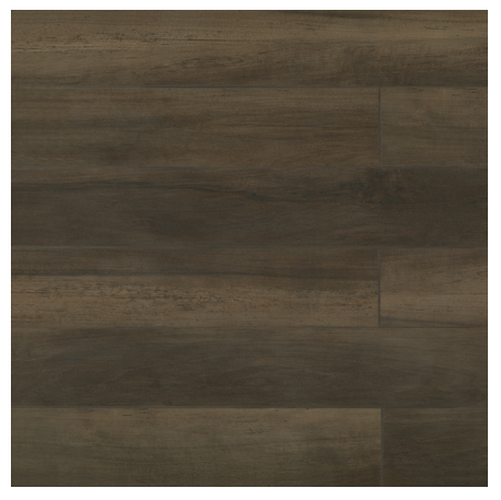
Wenge - WEN CRDANTWEN848-N - 8"x48" Rectified Field Tile - Matte