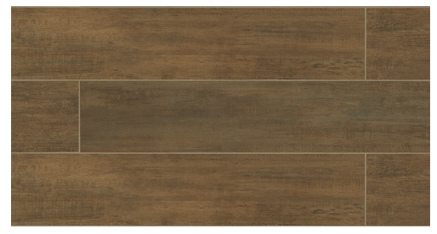
Vert - VER CRDBARVER840 - 8"x40" Rectified Field Tile - Matte