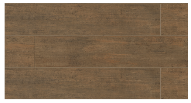
Brun - BRU CRDBARBRU840 - 8"x40" Rectified Field Tile - Matte