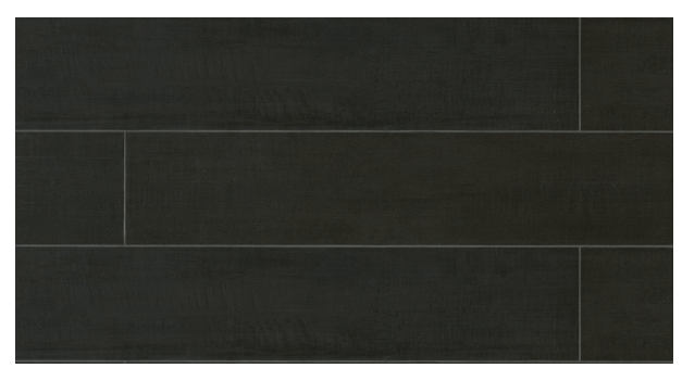
Noir - NOI CRDBARNOI840 - 8"x40" Rectified Field Tile - Matte