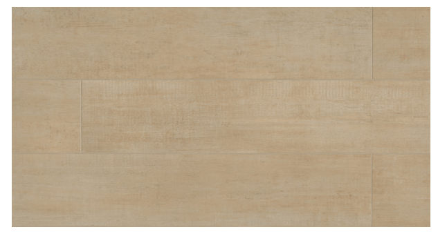
Ecru - ECR CRDBARECR840 - 8"x40" Rectified Field Tile - Matte