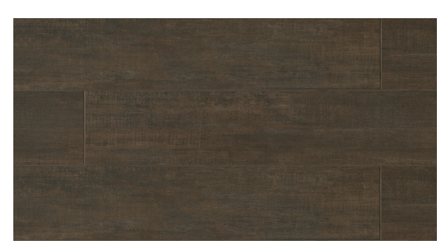
Fonce - FON CRDBARFON840 - 8"x40" Rectified Field Tile - Matte