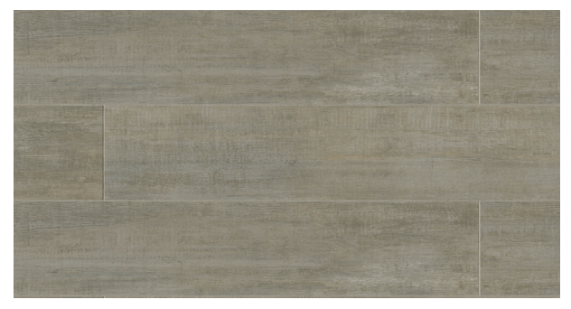
Gris - GRS CRDBARGRS840 - 8"x40" Rectified Field Tile - Matte