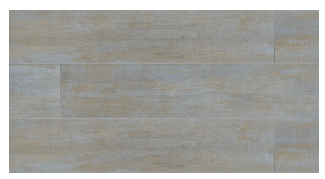
Bleu - BLE CRDBARBLE840 - 8"x40" Rectified Field Tile - Matte