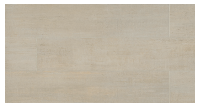
Blanc - BLA CRDBARBLA840 - 8"x40" Rectified Field Tile - Matte