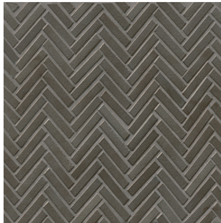
Metallic - MET DEC90MET122MO