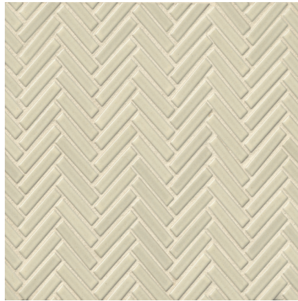
Off White - OFW DEC90OFW122MO