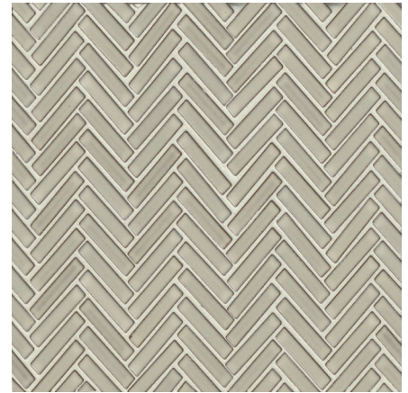
Putty - PUT DEC90PUT122MO