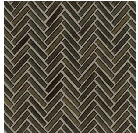
Shadow - SHA DEC90SHA122MO