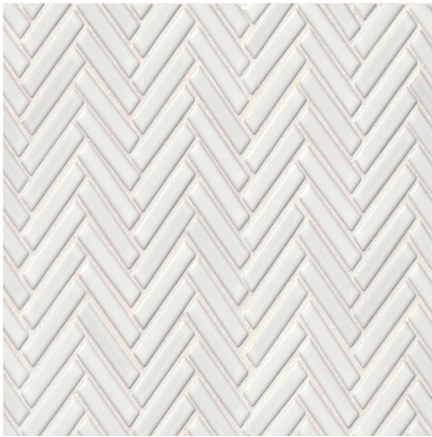
White - WHI DEC90WHI122MO

1/2"x2" Herringbone Mosaic - Gloss (11"x12 1/4" Sheet)