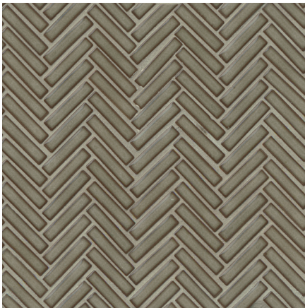
Gray Haze - GRH DEC90GRH122MO