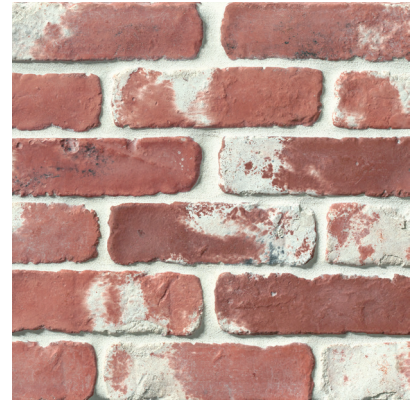
Used Red - USR DECAVOUSR28 - Antik Brick