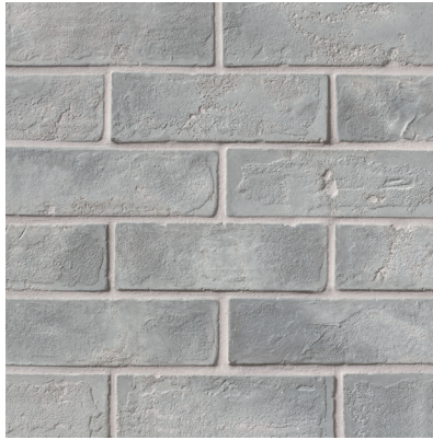
Sidewalk - SID DECAVOSID28 - Standard Brick