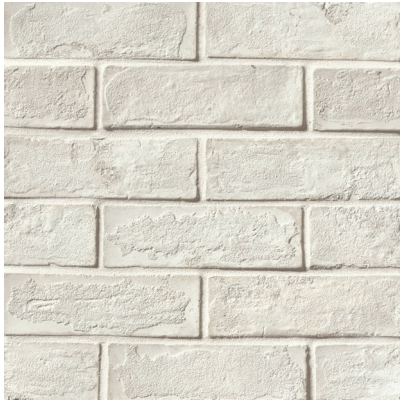
Early Grey - EAG DECAVOEAG28 - Brick