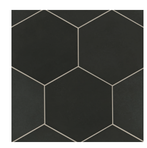
Kuroi Black - KUB DECMAKKUBHEX10M