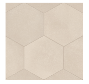
Tatami Beige - TAB DECMAKTABHEX10M