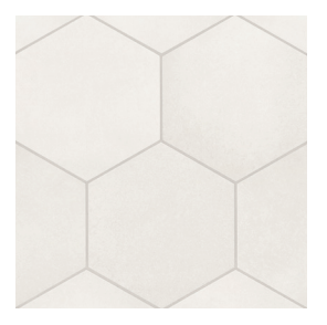
Shoji White - SHW DECMAKSHWHEX10M