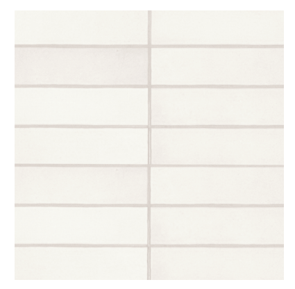
Shoji White - SHW DECMAKSHW2510M