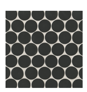
Kuroi Black - KUB DECMAKKUB2RMOM