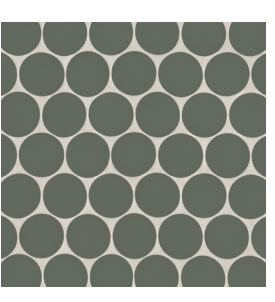
Midori Green - MIG DECMAKMIG2RMOM