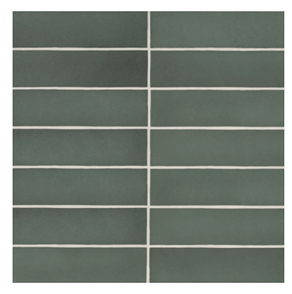
Midori Green - MIG DECMAKMIG2510M