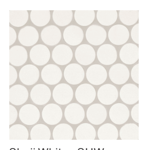
Shoji White - SHW DECMAKSHW2RMOM