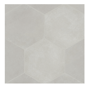
Kumo Grey - KUG DECMAKKUGHEX10M