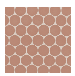
Umi Terracotta - UMT DECMAKUMT2RMOM