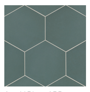
Arashi Blue - ARB DECMAKARBHEX10M