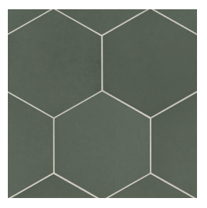
Midori Green - MIG DECMAKMIGHEX10M