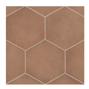
Umi Terracotta - UMT DECMAKUMTHEX10M