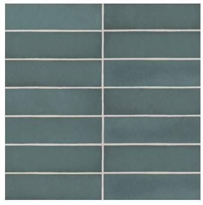
Arashi Blue - ARB DECMAKARB2510M