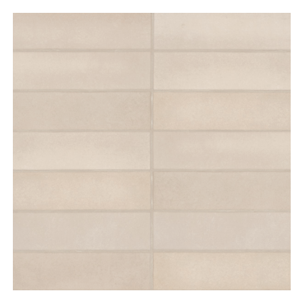
Tatami Beige - TAB DECMAKTAB2510M