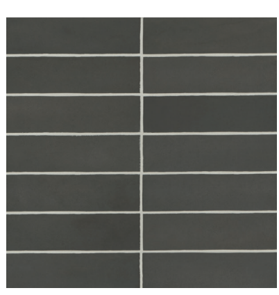
Kuroi Black - KUB DECMAKKUB2510M