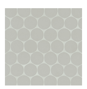
Kumo Grey - KUG DECMAKKUG2RMOM