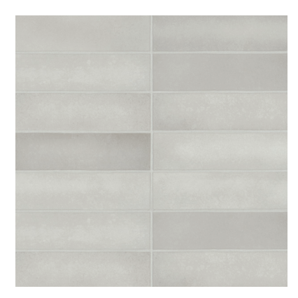
Kumo Grey - KUG DECMAKKUG2510M