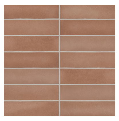
Umi Terracotta - UMT DECMAKUMT2510M