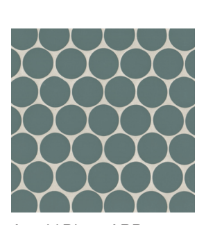
Arashi Blue - ARB DECMAKARB2RMOM