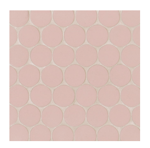
Momoiro Blush - MOB DECMAKMOB2RMOM