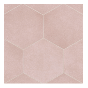
Momoiro Blush - MOB DECMAKMOBHEX10M