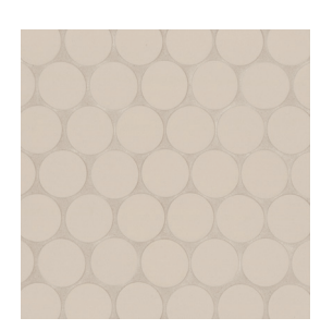
Tatami Beige - TAB DECMAKTAB2RMOM