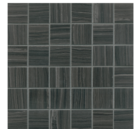
Unica - UN DOLMATUN22MO