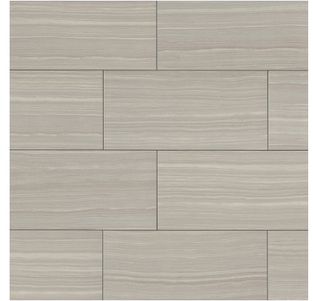
Azzurra - AZ DOLMATAZ1224 - 12"x24" Non-Rectified Field Tile - Honed DOLMATAZ1836 - 18"x36" Non-Rectified Field Tile - Honed