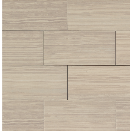
Classica - CL DOLMATCL1224 - 12"x24" Non-Rectified Field Tile - Honed DOLMATCL1836 - 18"x36" Non-Rectified Field Tile - Honed