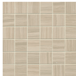
Classica - CL DOLMATCL22MO