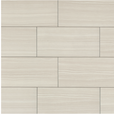
Brillante - BR DOLMATBR1224 - 12"x24" Non-Rectified Field Tile - Honed DOLMATBR1836 - 18"x36" Non-Rectified Field Tile