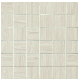
Brillante - BR DOLMATBR22MO