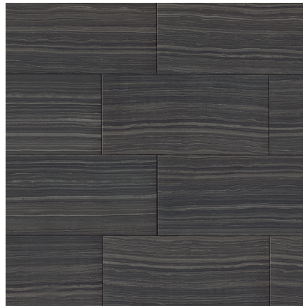
Unica - UN DOLMATUN1224 - 12"x24" Non-Rectified Field Tile - Honed DOLMATUN1836 - 18"x36" Non-Rectified Field Tile - Honed