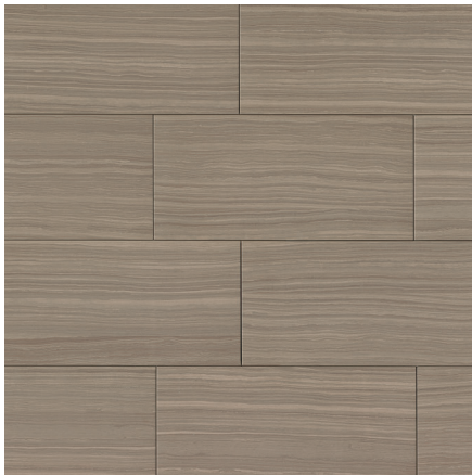
Tabacco - TA DOLMATTA1224 - 12"x24" Non-Rectified Field Tile - Honed DOLMATTA1836 - 18"x36" Non-Rectified Field Tile - Honed