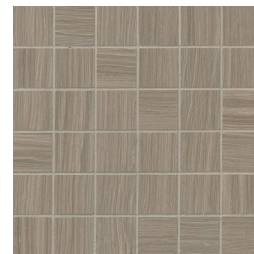
Tabacco - TA DOLMATTA22MO