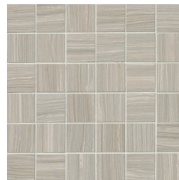
Azzurra - AZ DOLMATAZ22MO