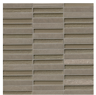
Dark Gray - DGR GLSTESDGRSTB 1/2"x4" Stacked Textured Blend (11 3/4"x12" Sheet)