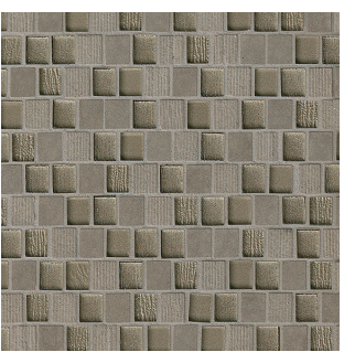
Dark Gray - DGR GLSTESDGROBPB 3/4"x1" Offset Brick Pattern Tex. Blend (11 3/4"x12" Sheet)