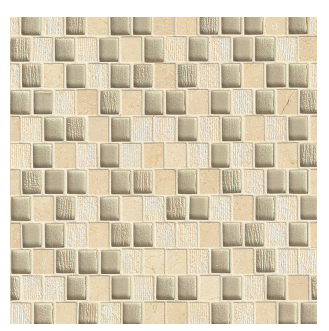
Beige - BEI GLSTESBEIOBPB 3/4"x1" Offset Brick Pattern Tex. Blend (11 3/4"x12" Sheet)