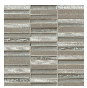
Gray - GRA GLSTESGRASTB 1/2"x4" Stacked Textured Blend (11 3/4"x12" Sheet)