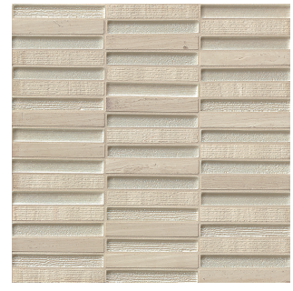
Silver - SIL GLSTESSILSTB 1/2"x4" Stacked Textured Blend (11 3/4"x12" Sheet)