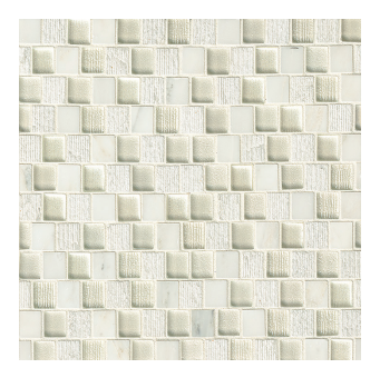
White - WHI GLSTESWHIOBPB 3/4"x1" Offset Brick Pattern Tex. Blend (11 3/4"x12" Sheet)