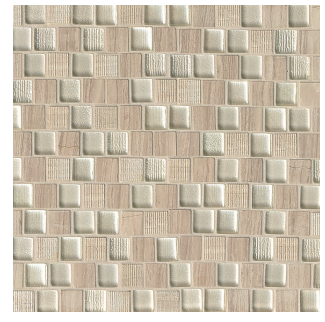
Silver - SIL GLSTESSILOBPB 3/4"x1" Offset Brick Pattern Tex. Blend (11 3/4"x12" Sheet)