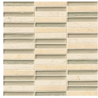
Beige - BEI GLSTESBEISTB 1/2"x4" Stacked Textured Blend (11 3/4"x12" Sheet)