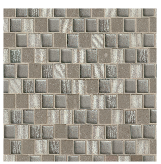
Gray - GRA GLSTESGRAOBPB 3/4"x1" Offset Brick Pattern Tex. Blend (11 3/4"x12" Sheet)