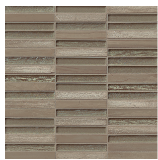
Taupe - TAU GLSTESTAUSTB 1/2"x4" Stacked Textured Blend (11 3/4"x12" Sheet)