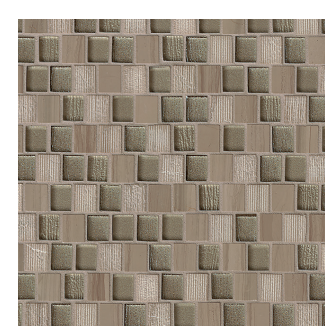
Taupe - TAU GLSTESTAUOBPB 3/4"x1" Offset Brick Pattern Tex. Blend (11 3/4"x12" Sheet)