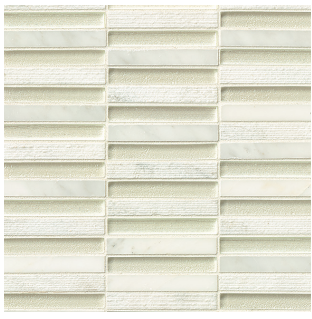
White - WHI GLSTESWHISTB 1/2"x4" Stacked Textured Blend (11 3/4"x12" Sheet)