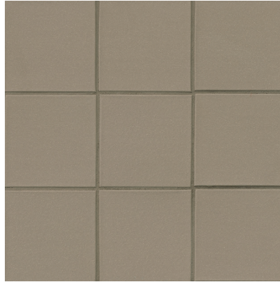
Puritan Gray - 507 MET50766 - 6"x6" Field Tile - Honed MET50788 - 8"x8" Field Tile - Honed