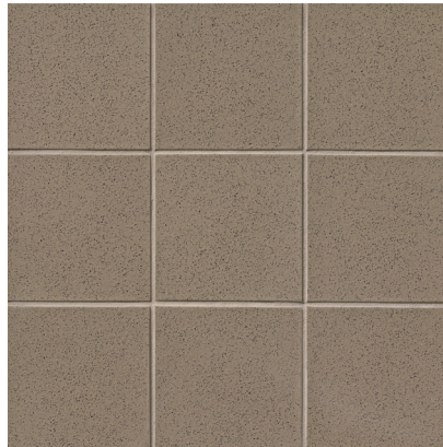
Puritan Gray - 57XA MET57XA66 - 6"x6" XA Abrasive Field Tile - Honed