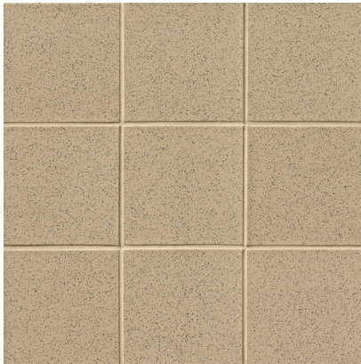
Buckskin - 15XA MET15XA66 - 6"x6" XA Abrasive Field Tile - Honed