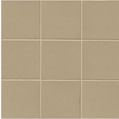
Buckskin - 105 MET10566 - 6"x6" Field Tile - Honed MET10588 - 8"x8" Field Tile - Honed