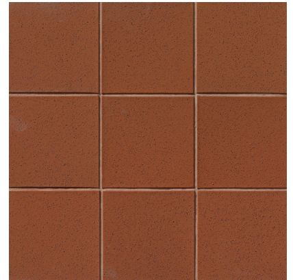
Mayflower Red - 31XA MET31XA66 - 6"x6" XA Abrasive Field Tile - Honed