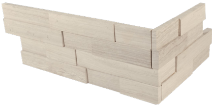
MRBASHGRYLED CNR 6"x24" Ledger Corner - Honed