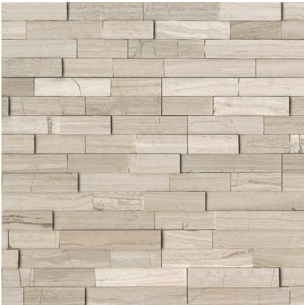
MRBASHGRYLED 6"x24" Ledger - Honed