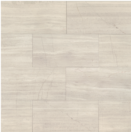
MRBASHGRY1224H - 12"x24" Honed