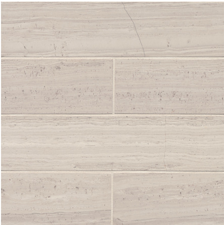
100000876 - 3"x12" - Brushed