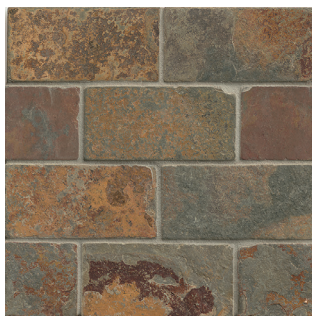
SLTBUTSCO0306T 3"x6" - Tumbled