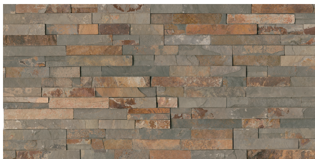
SLTBUTSCOLED 6"x24" Ledger - Natural Cleft