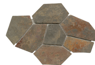
SLTBUTSCORMM Random Mosaic Mount - Natural Cleft