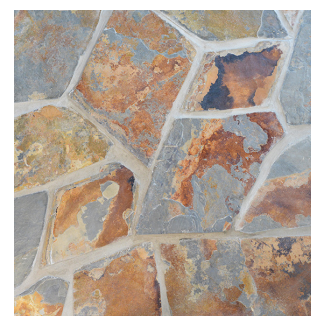
SLTBUTSCOFLAG Flagstone - Natural Cleft (Pallet= 1 Ton, 180-200 Sq. Ft. per Pallet)