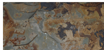
SLTBUTSCOCAP 12"x24"x2" Thick Wall Cap - Natural Cleft