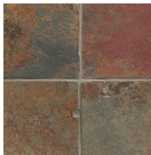
SLTBUTSCO0606T 6"x6" - Tumbled