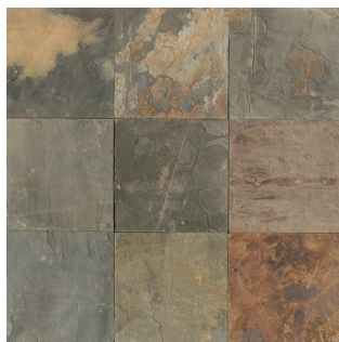
SLTBUTSCO1212G - 12"x12" Gauged SLTBUTSCO1616G - 16"x16" Gauged SLTBUTSCO2424G - 24"x24" Gauged