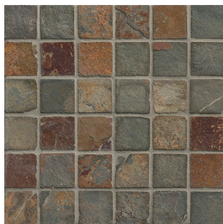
SLTBUTSCO0202MT 2"x2" Mosaic - Tumbled (12"x12" Sheet)