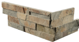
SLTBUTSCOLEDNR 6"x24" Ledger Corner - Natural Cleft