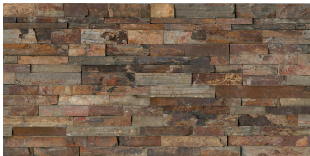
SLTBUTSCOSF 6"x24" Split Face Ledger - Natural Cleft