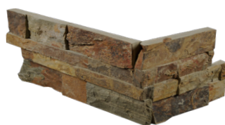
SLTBUTSCOSFCNR 6"x24" Split Face Corner - Natural Cleft