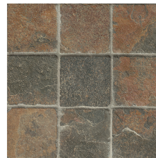
SLTBUTSCO0404T 4"x4" - Tumbled