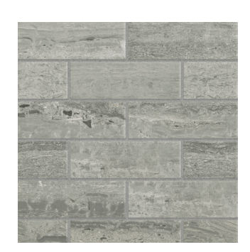
Travertino Grigio - TRG STPCL2TRG26MO - Matte STPCL2TRG26MO-P - Polished