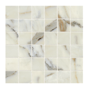
Calacatta Oro - CAO STPCL2CAO22MO - Matte STPCL2CAO22MO-P - Polished