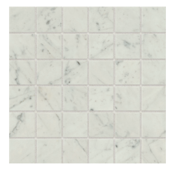
Bianco Carrara - BIC STPCL2BIC22MO - Matte STPCL2BIC22MO-P - Polished