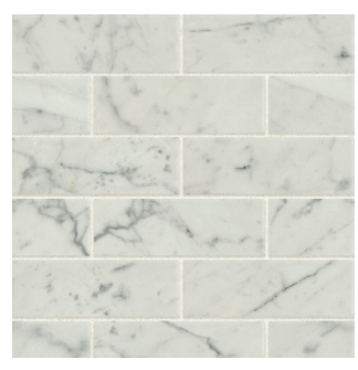
Bianco Carrara - BIC STPCL2BIC26MO - Matte STPCL2BIC26MO-P - Polished