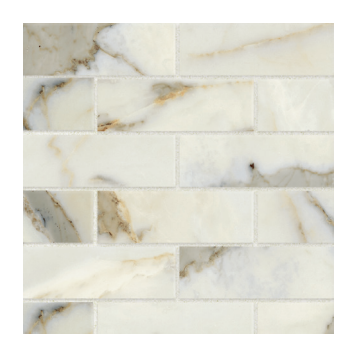
Calacatta Oro - CAO STPCL2CAO26MO - Matte STPCL2CAO26MO-P - Polished