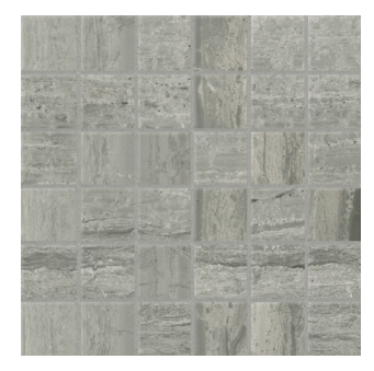
Travertino Grigio - TRG STPCL2TRG22MO - Matte STPCL2TRG22MO-P - Polished