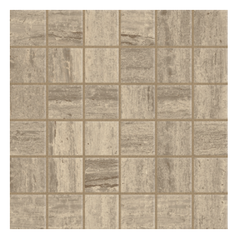
Travertino Chiaro - TRC STPCL2TRC22MO - Matte STPCL2TRC22MO-P - Polished