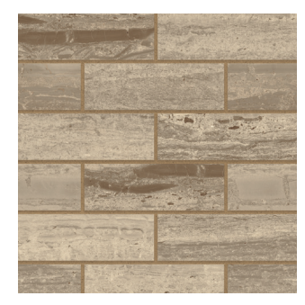
Travertino Chiaro - TRC STPCL2TRC26MO - Matte STPCL2TRC26MO-P - Polished