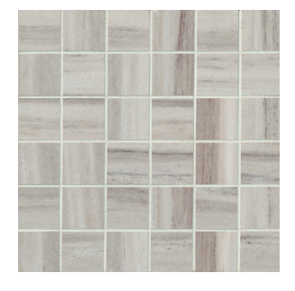
Bluette - BLU STPZEBBLU22MO 2"x2" Mosaic - Matte (12"x12" Sheet)