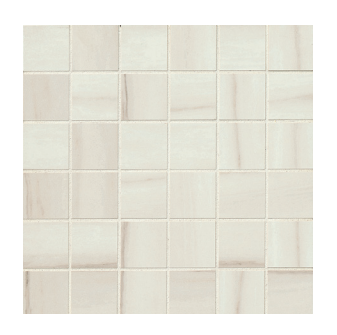
Michelangelo - MIC STPZEBMIC22MO 2"x2" Mosaic - Matte (12"x12" Sheet)