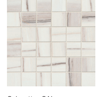
Calacatta - CAL STPZEBCAL22MO 2"x2" Mosaic - Matte (12"x12" Sheet)