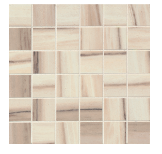
Classico - CLA STPZEBCLA22MO 2"x2" Mosaic - Matte (12"x12" Sheet)