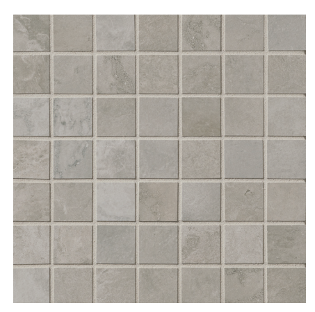
Classico - C TCRCEM15CM 1 1/2"x1 1/2" Mosaic - Matte/Polished (10"x12" Sheet)