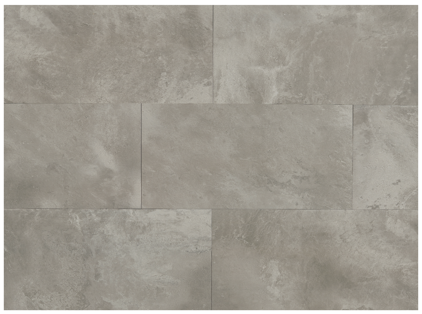
Classico - C TCRCEM36C - 12"x24" Matte TCRCEM36CP - 12"x24" Polished TCRCEM60C - 24"x24" Matte TCRCEM60CP - 24"x24" Polished