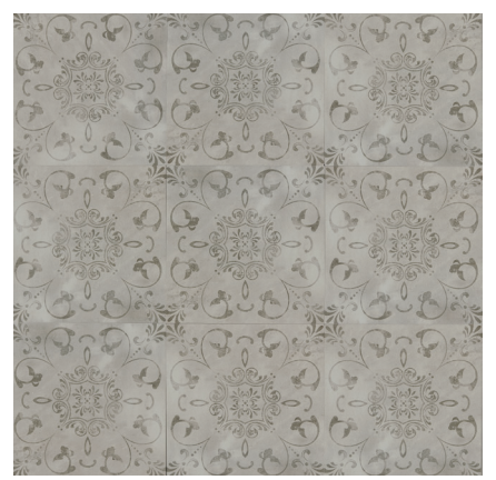
Classico - C TCRCEM60DC - 24"x24" Deco A - Matte