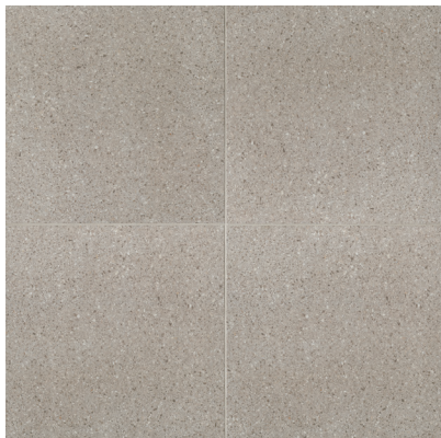
Light Gray - LG TCRTER25LG - 10"x10" Matte TCRTER50LG - 20"x20" Matte