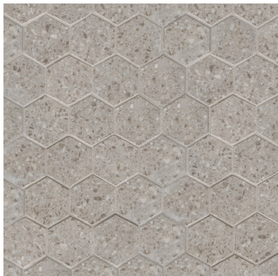
Light Gray - LG TCRTER221HEXLG