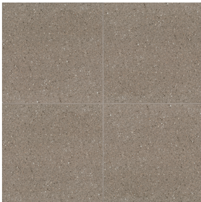
Medium Gray - MG TCRTER25MG - 10"x10" Matte TCRTER50MG - 20"x20" Matte