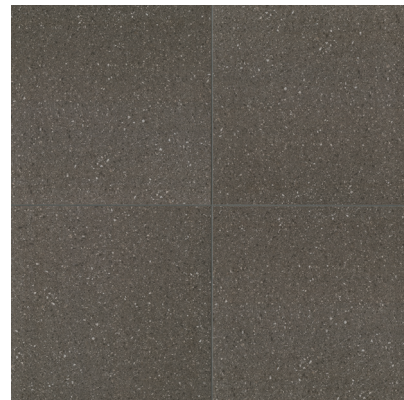
Dark Gray - DG TCRTER25DG - 10"x10" Matte TCRTER50DG - 20"x20" Matte