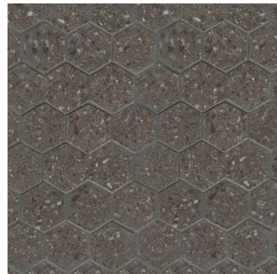
Dark Gray - DG TCRTER221HEXDG