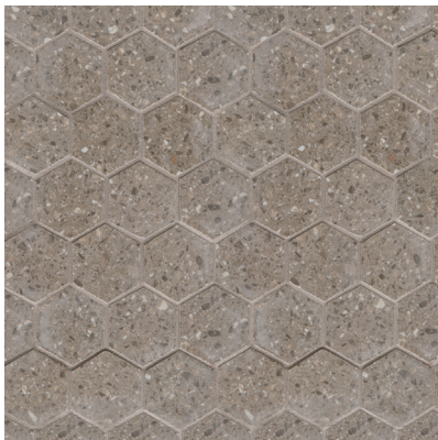
Medium Gray - MG TCRTER221HEXMG