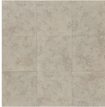
TCRVER30ST - 12" x 12" TCRVER50ST - 20" x 20"