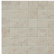
TCRVER22ST 2" x 2" Mosaic Mesh-mounted on a 12" x 12" sheet