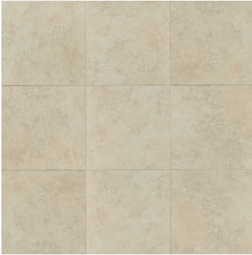
TCRVER30AT - 12" x 12" TCRVER50AT - 20" x 20"