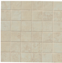
TCRVER22AT 2" x 2" Mosaic Mesh-mounted on a 12" x 12" sheet