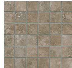
TCRVER22OT 2" x 2" Mosaic Mesh-mounted on a 12" x 12" sheet