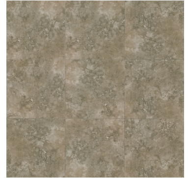
TCRVER30OT - 12" x 12" TCRVER50OT - 20" x 20"