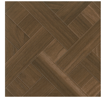
TCRWQ50W - 20" x 20"