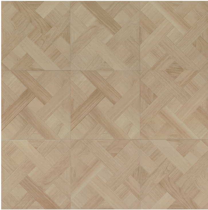
TCRWQ50B - 20" x 20"