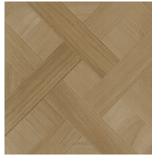
TCRWQ50C - 20" x 20"