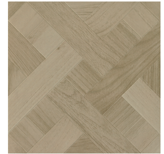
TCRWQ50O - 20" x 20"