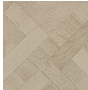
TCRWQ50P - 20" x 20"