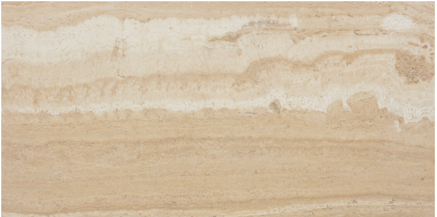
TRVAYMCRMSLAB2FH - 2cm Slab Filled & Honed TRVAYMCRMSLAB2P - 2cm Slab Filled & Polished TRVAYMCRMSLAB2FHVC - 2cm Slab Filled Vein-Cut - Honed TRVAYMCRMSLAB2PVC - 2cm Slab Filled Vein-Cut - Polished