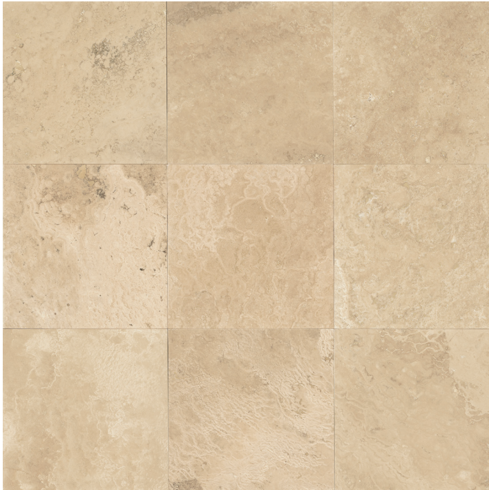
TRVAYMCRM1224FHVC - 12"x24" Filled Vein-Cut - Honed TRVAYMCRM1224PVC - 12"x24" Filled Vein-Cut - Polished TRVAYMCRM1818FH - 18"x18" Filled & Honed TRVAYMCRM1836FHVC - 18"x36" Filled Vein-Cut - Honed TRVAYMCRM1836PVC - 18"x36" Filled Vein-Cut - Polished TRVAYMCRM2424FH - 24"x24" Filled & Honed