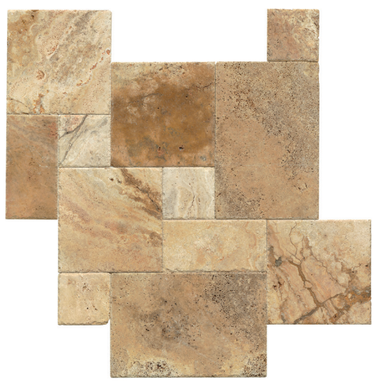
TRVSCABOSVPUHC - Versailles Pattern Bundle Brushed & Chiseled (8 sq ft per bundle)