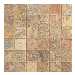
TRVSCABOS22T 2"x2" Mosaic - Tumbled (12"x12" Sheet)