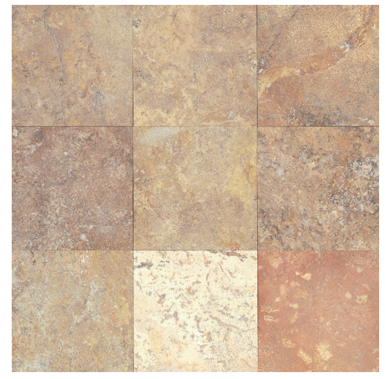
TRVSCABOS1212FH - 12"x12" Filled & Honed TRVSCABOS1224FH - 12"x24" Filled & Honed TRVSCABOS1818FH - 18"x18" Filled & Honed