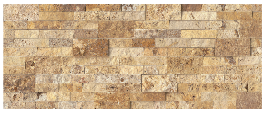
TRVSCABOSSFP 6"x24" Split Face Panel