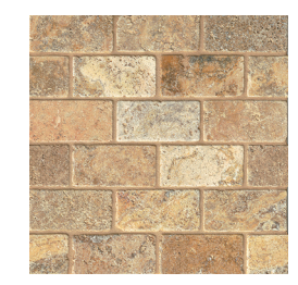
TRVSCABOS24T 2"x4" Mosaic - Tumbled (12"x12" Sheet)