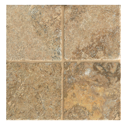
TRVSCABOS66T 6"x6" Tumbled