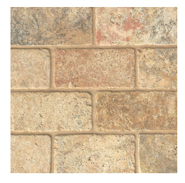
TRVSCABOS36T 3"x6" Tumbled