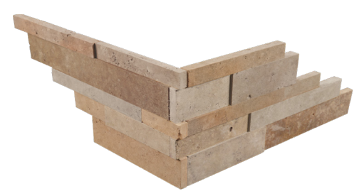
TRVSCABOSCONCNR 6"x24" Contemporary Corner - Honed