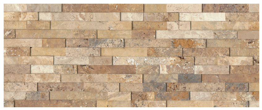
TRVSCABOSCONP 6"x24" Contemporary Panel - Honed