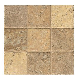
TRVSCABOS44T 4"x4" Tumbled