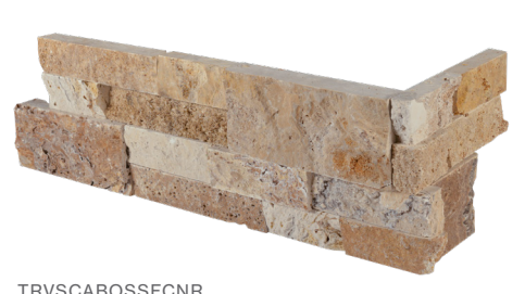
TRVSCABOSSFCNR 6"x24" Split Face Corner