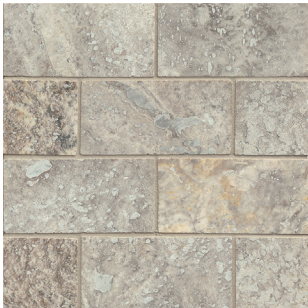
TRVSILMST36FH 3"x6" - Filled & Honed