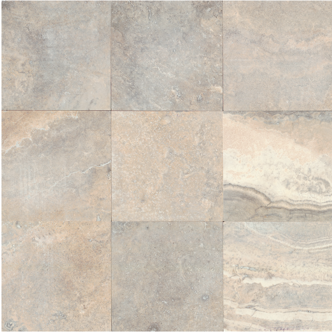
TRVSILMST1212FH - 12"x12" Filled & Honed TRVSILMST1224FHVC - 12"x24" Filled & Honed Vein-Cut TRVSILMST1616BS - 16"x16" Brushed & Straight TRVSILMST1818FH - 18"x18" Filled & Honed