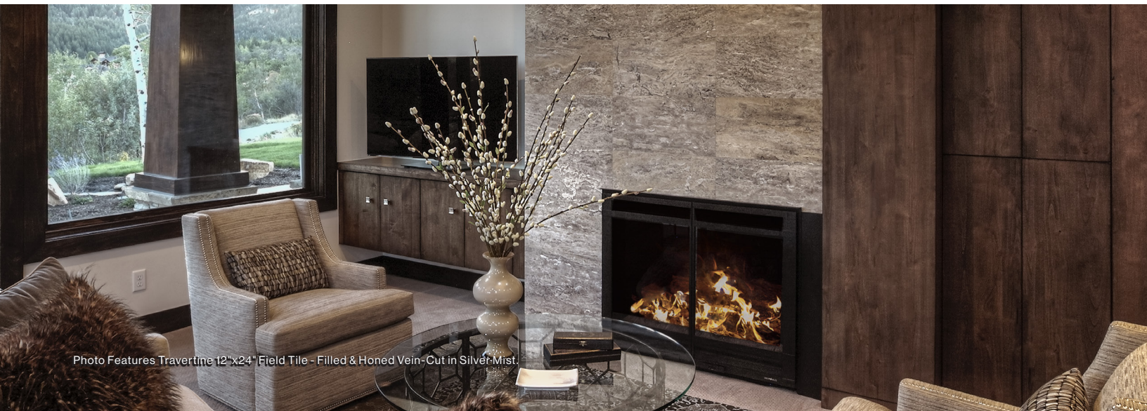
Photo Features Travertine 12" x24" Field Tile - Filled & Honed Vein-Cut in Silver Mist.