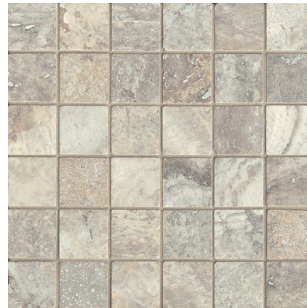
TRVSILMST22FH 2"x2" Mosaic - Filled Straight Edge - Honed (12"x12" Sheet)