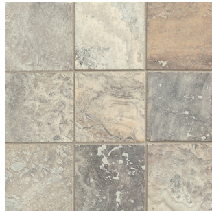
TRVSILMST44FH - 4"x4" Filled & Honed TRVSILMST66FH - 6"x6" Filled & Honed