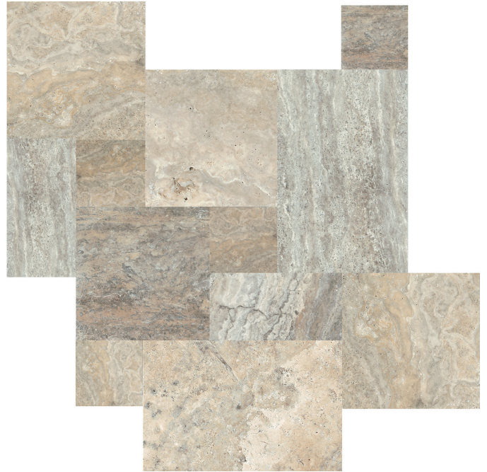
TRVSILMSTBUNDLE - Versailles Pattern Bundle Brushed & Straight Edge (8 Sq. Ft. per bundle)