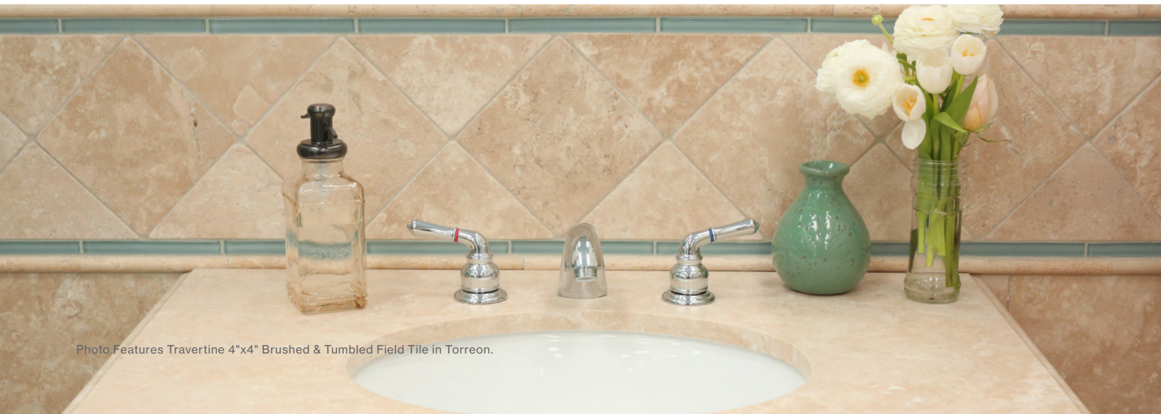
Photo Features Travertine 4"x4" Brushed & Tumbled Field Tile in Torreón.