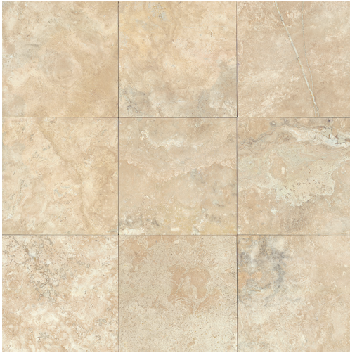
TRVTORREON1212FH - 12"x12" Filled & Honed TRVTORREON1212T - 12"x12" Brushed & Tumbled TRVTORREON1616FH - 16"x16" Filled & Honed TRVTORREON1616T - 16"x16" Brushed & Tumbled TRVTORREON1818FH - 18"x18" Filled & Honed TRVTORREON1818T - 18"x18" Brushed & Tumbled TRVTORREON2424FH - 24"x24" Filled & Honed