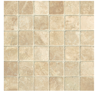
TRVTORREON22T 2"x2" Mosaic - Brushed & Tumbled (12"x12" Sheet)