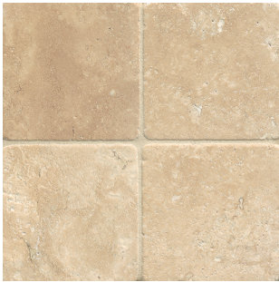
TRVTORREON66T 6"x6" - Brushed & Tumbled