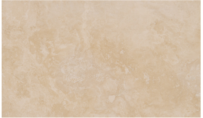
TRVTORREONSLAB2FH - 2 cm Slab Filled & Honed TRVTORREONSLAB3FH - 3 cm Slab Filled & Honed