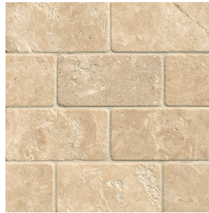
TRVTORREON36T 3"x6" - Brushed & Tumbled