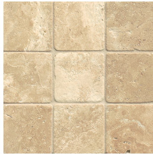
TRVTORREON44T 4"x4" - Brushed & Tumbled